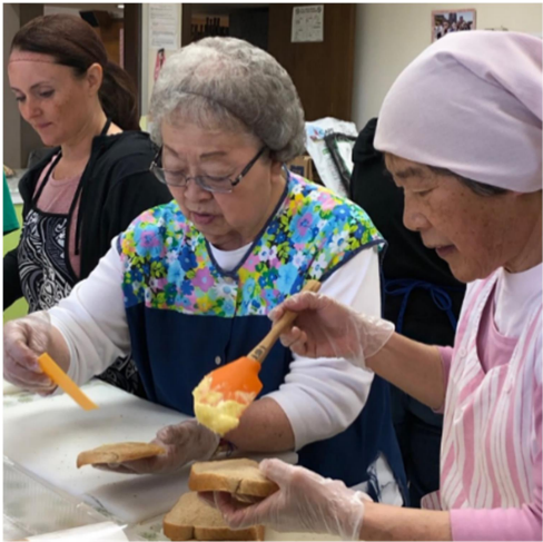
Lunch for yard workers