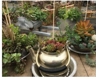
Kimono/Plant & Bake sale