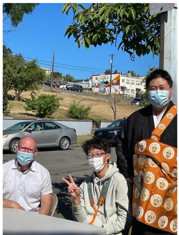
In-person outdoor service in July. Remember the sunny weather and seeing smiling eyes in the temple's garden?