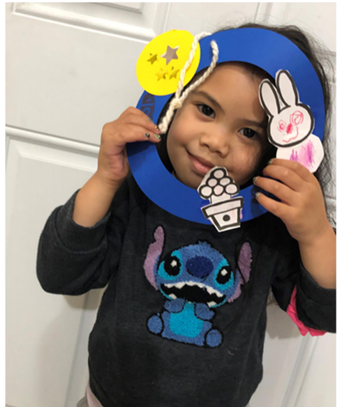
Seasons Greetings and Happy Holidays! Examples