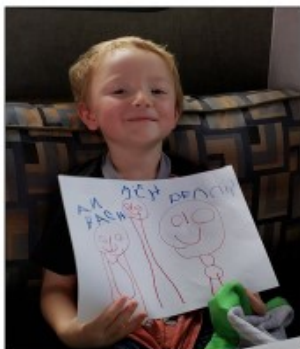
Happy Grandparents' Day!!!