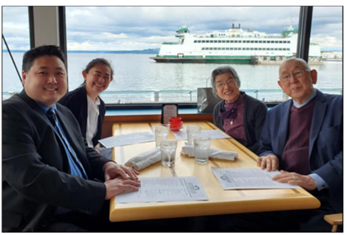
'Finally' able to enjoy the view, the food, the company....