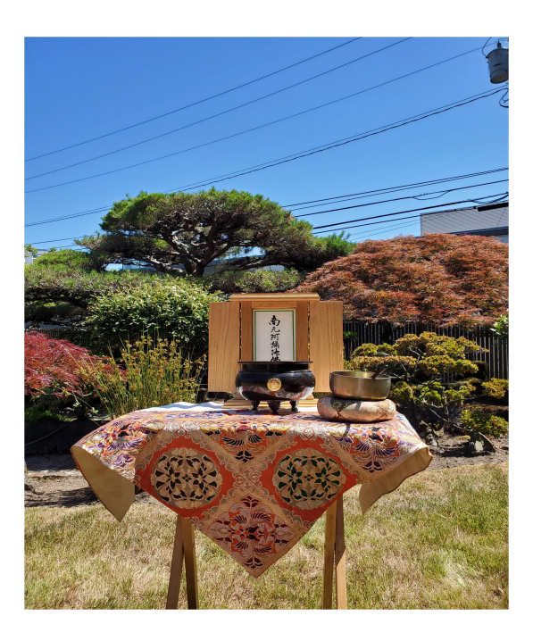
July 25th - 10:00 am