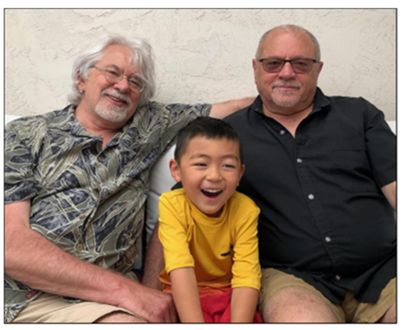
"The Three Amigos"