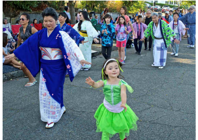
2016 Obon Dance Festival