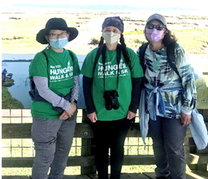
Hunger Walk 2021 – Nisqually National Refuge walk