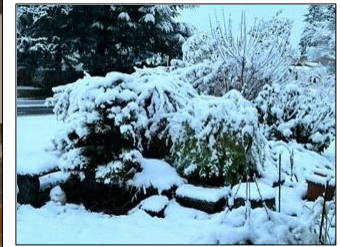
Winter also attended...