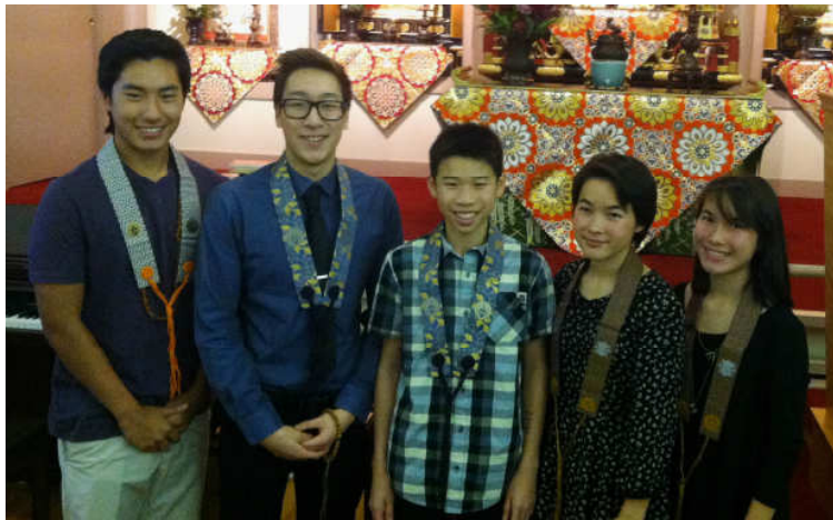
Bodhi Day Service conducted by Lotus Class Students Great Job!