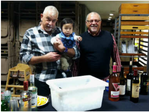
Bodhi Day Party!